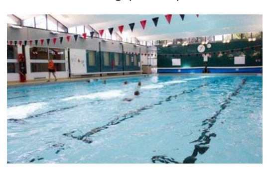
Sport Clubs News

If you have any questions about Y3 Swimming, please speak to the PE Team or your child's Class Teacher.