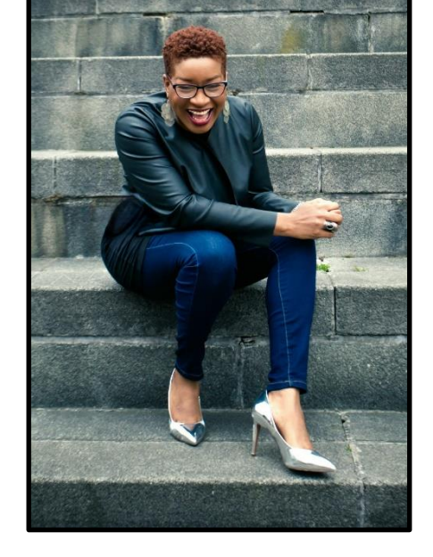
What a week we have had!